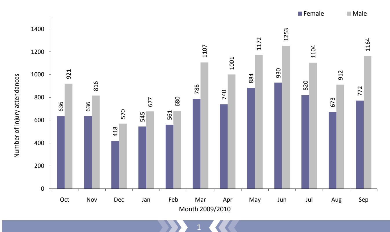
Figure 1: Gender of injury attendances by month, October 2009 to September 2010.

Table 3 illustrates the method of discharge of injury attendances. Almost two thirds (64%) of all injury attendances were discharged.